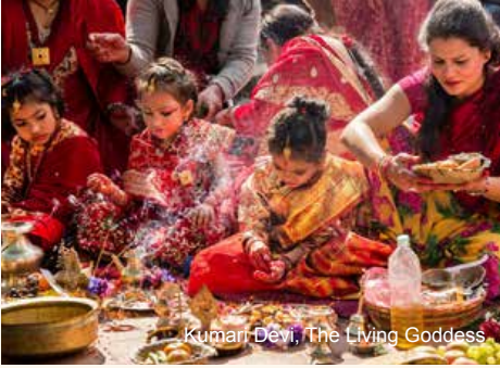
Kumari Devi, The Living Goddess